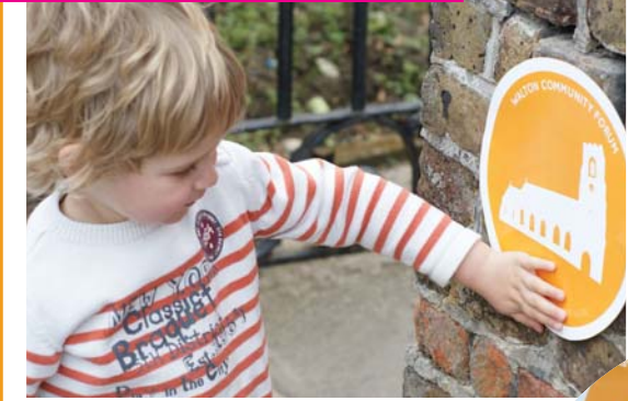
Follow the trail for tips and things to do along the way.

Welcome to the Little Explorers Trail and information leaflet! There are simply loads of fun things to do in and around Walton, for children of all ages! Whether you live here, or are visiting, with the help of local mums, we've listed them here, with something for all budgets!