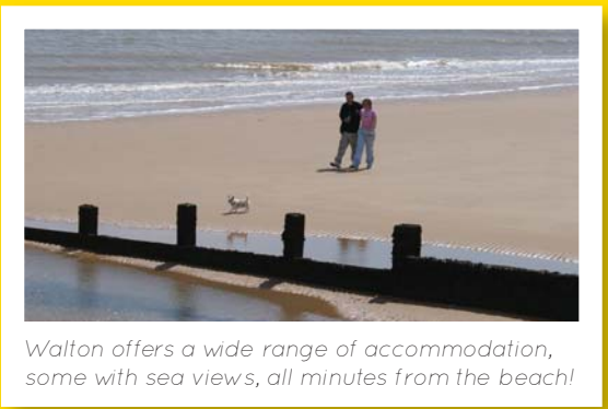
Walton offers a wide range of accommodation, some with sea views, all minutes from the beach!

For families and young children, tactile signs guide you around things to do and discover in Walton.