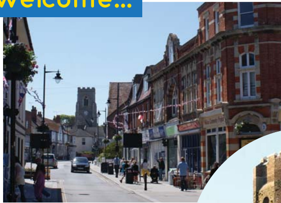
Shop along Walton's Victorian High Street, full of independent shops!

Walton-on-the-Naze, known as England's friendliest resort, is one of the sunniest spots in the country!